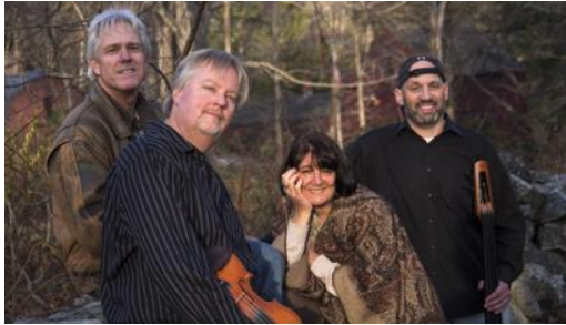
Seat of Our Pants

6:30 to 8pm at the Center School Gazebo featuring a performance by "Seat of Our Pants", an acoustic, folk, blues and bluegrass group from Marlborough.